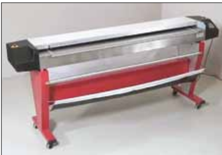
Very easy handling