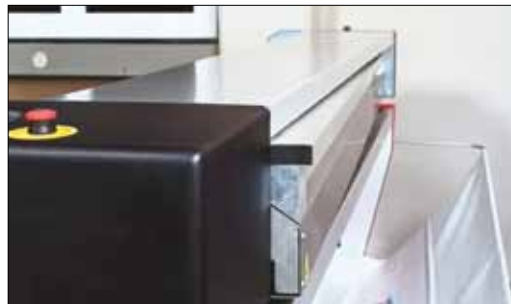
The self-squaring blade follows any printing misalignment