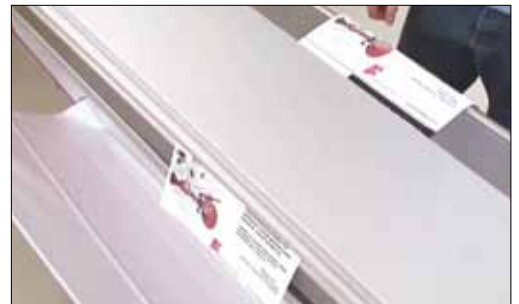
Can cut different sizes in the same roll (Digitrim nesting)