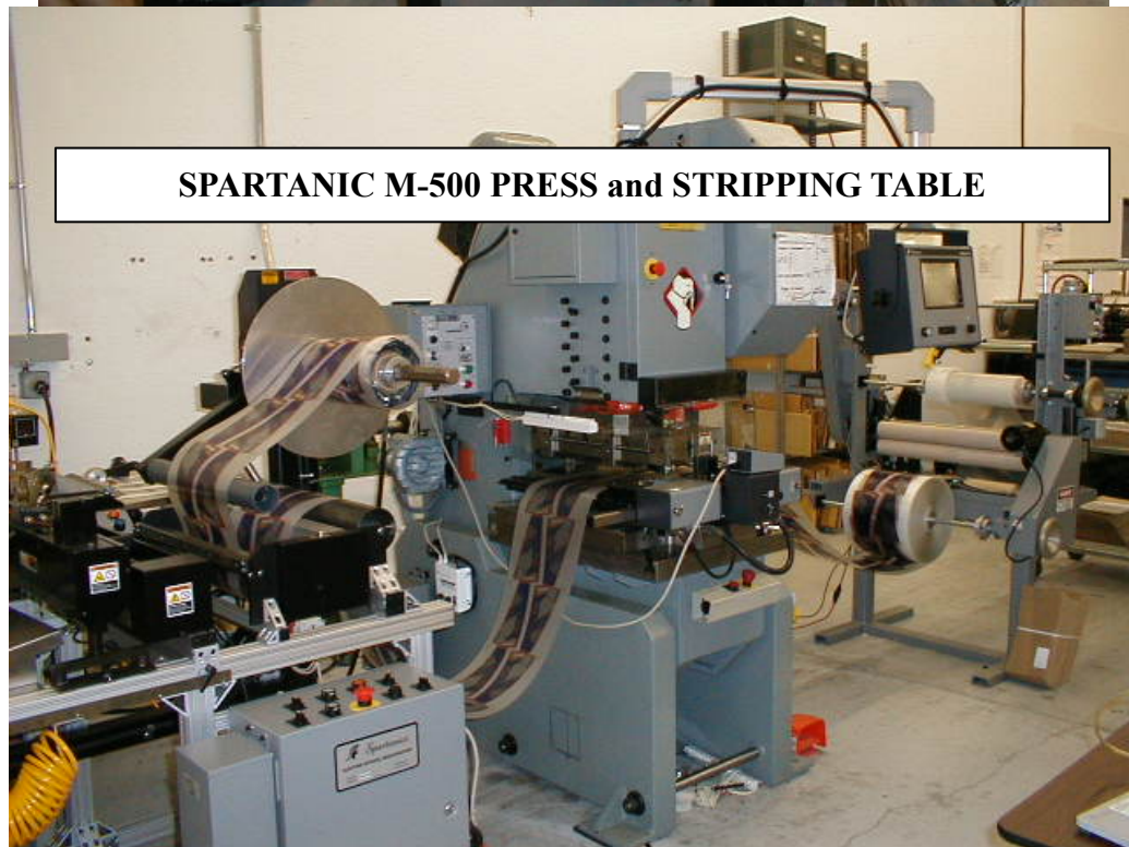
SPARTANIC M-500 PRESS and STRIPPING TABLE

Multilingual and graphic icon touch screen: